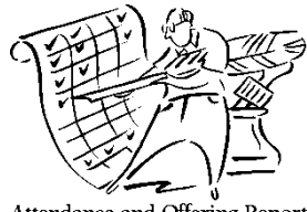
Attendance and Offering Report

If you are a guest this morning, welcome to Centre Church. Please fill out a yellow pew card and put it in the offering plate to tell us who you are and how we might be of service to you. If you would like more information about Centre Church, please pick up a welcome packet from the shelves by the sanctuary doors.